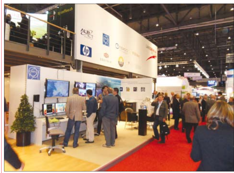
The popular "Lake Geneva Region" stand, including the seven screens connected to the CERN intranet to showcase the Large Hadron Collider.

Telecom World 2009 took place at Geneva's Palexpo on 5–9 October. This high-profile internationally renowned show, organised by the International Telecommunications Union (ITU), attracts visitors from the public and private sectors sharing a common interest in information technologies and communication. While the show was significantly smaller than in previous years, Asia and Africa were strongly represented.